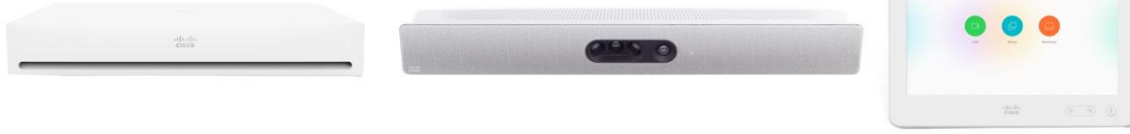
Figure 2. Cisco Webex Room Kit Pro integrator package with Quad Camera and Touch 10