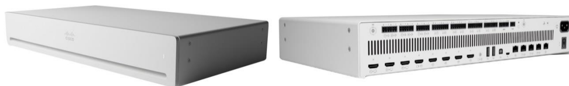
Figure 1. Cisco Webex Codec Pro

With its powerful media engine, the Room Kit Pro lets you build the video collaboration room of your dreams.