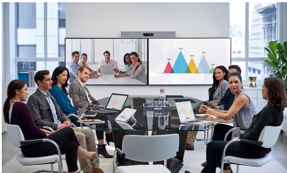
Figure 1. Cisco Webex Room Kit Plus in Large Conference Room

The Room Kit Plus – comprising a powerful codec and a quad-camera bar with integrated speakers and microphones* – is ideal for rooms that seat up to 14 people. It offers sophisticated camera technologies that bring speaker-tracking and auto-framing capabilities to medium to large-sized rooms. The product is rich in functionality and experience but is priced and designed to be easily scalable to all of your conference rooms and spaces – whether registered on the premises or to Cisco Webex.