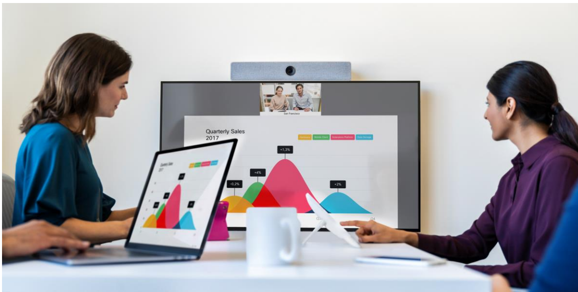
Figure 1. Cisco Webex Room Kit Mini in a Small Room

The Room Kit Mini is ideal for huddle spaces with three to five people because of its wide 120-degree field of view, which allows everyone in a huddle space to be seen. It also offers the flexibility to connect to laptop-based video conferencing software via USB. The Mini is tightly integrated with the industry-leading Cisco ® Webex platform for continuous workflow, and can register on premises or to Cisco Webex in the cloud.