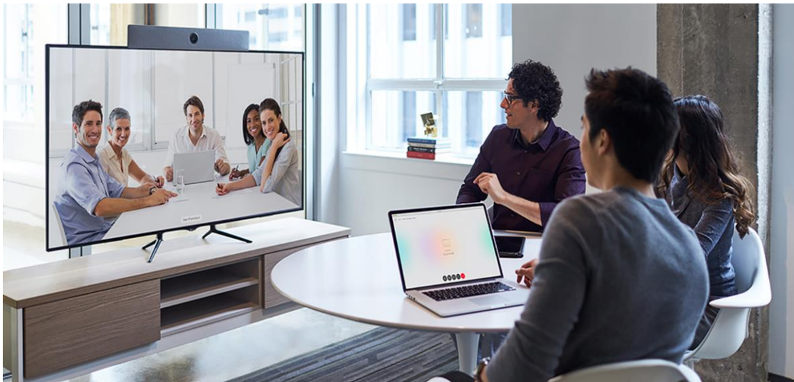
Figure 1. Cisco Webex Room Kit in small room scenario

The Room Kit – which includes camera, codec, speakers, and microphones integrated in a single device – is ideal for rooms that seat up to seven people. It offers sophisticated camera technologies that bring speaker-tracking capabilities to smaller rooms. The product is rich in functionality and experience but is priced and designed to be easily scalable to all of your small conference rooms and spaces – whether registered on the premises or to Cisco Webex.